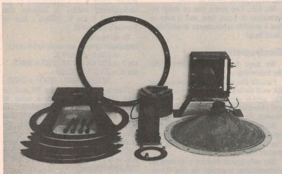
Fig.1: The component parts of a 1930 Kolster Brandes speaker. The construction is typical of early models, which are easily taken apart for repairs — unlike more modern models. This model has no hum-bucking coil or shading ring.

All too often, a fine old receiver will be found to have hosted a colony of mice. For some reason, rodents find radios irresistible locations for setting up house, causing considerable damage from corrosion and gnawing, and there seems to be a premium on shredded speaker cones as nesting material.