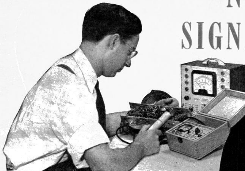
Serviceman employing the CA-11 signal tracer to check receiver.

By SHEPARD S. LITT, 2LCC Superior Instruments Co.