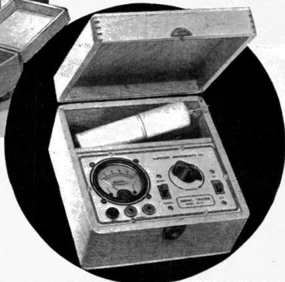
Commercially constructed unit.

Design of a highly sensitive and portable signal tracer. Simplicity of operation makes this tester ideal for home receiver repair—an important factor to servicemen.