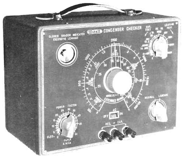
STARKIT MODEL BJ-1

The STARKIT Model BJ-1 is housed in an attractive steel case with rounded corners and neat gray finish. A sturdy leather carrying handle is securely attached to the top of the cabinet for ease of portability. All operating controls are located on the front panel to allow the operator the maximum in working efficiency. Each control is clearly marked as to its function with the lettering being deeply etched into the panel for life time use. With the magic eye set to maximum all readings can be read directly off the deep-etched dial. Your best buy is STARKIT . . . the most in quality for the least in cost.