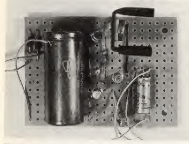
Figure 15.1 Bench power supply

A bench power supply is one of the most useful pieces of equipment for anyone interested in electronic project construction to have around the workshop, even if the supply is only a relatively simple affair, such as the unit described here.