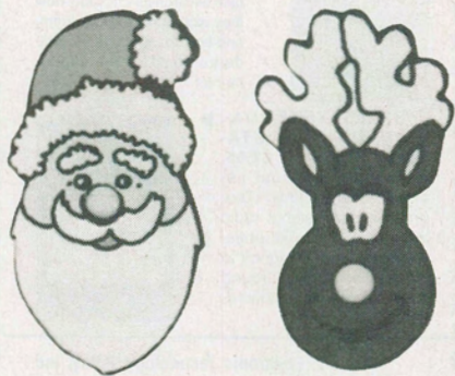
Fig. 2. Shown here are two full-size templates of the faces used by the author. Each has a \frac{3}{16} -inch hole in the nose, through which the LED will protrude.

hold the stick pin. The non-pointed end of the pin should line up with the ends of the "U" loop and be parallel with them. Optionally, you can bend the non-pointed end of the stick pin into a loop as shown. Doing so helps to hold the battery in place.