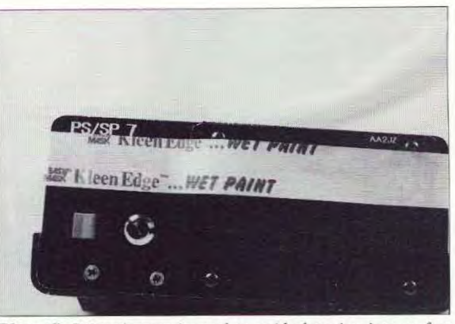
Photo C. Painter's tape is used to guide lettering into perfect alignment.

from the "professional" appearance desired in a finished project. This also applies to multiple rows of controls. Allow additional space between rows for lettering if needed.