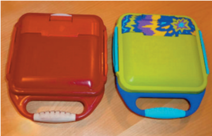
Cool Gear products, including lunch boxes and water bottles, are made with a Dimension 3D Printer.