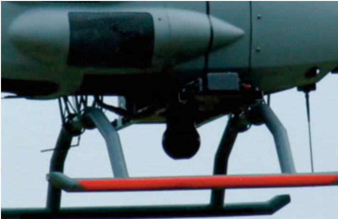
DST Control's electro-optical gimbal – essentially an electronic eye – is mounted on a helicopter and tested.

its deliveries include some element of customization. Previously, the company used techniques such as outsourced CNC milling to manufacture the aluminum core of its products. But this became problematic for three reasons: fast-rising costs, a critical dependency on suppliers who tended to prioritize higher-volume orders, and the fact that some parts require customization, which was time-consuming.