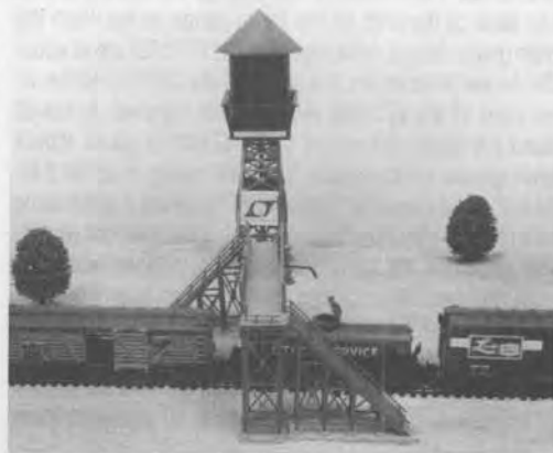
Figure 1. A Typical Application. Automatic Filling at a Railroad Siding.

was designed to implement an automatic filling station for the model train shown in Figure 1. When S1 is closed the MC68HC05 processor reads the LTC1092. If the weight is below the preprogrammed limit in the processor then the motor drive line which controls the pump is turned on. The LTC1092 is continually read by the processor as the truck is filled, until the limit is reached. The motor drive line is then shut off. The limit may be derived in a number of ways. A fixed limit will result in filling to an absolute weight, while relative or tare weight filling can be implemented when the measured empty weight is used in the calculation of the limit. Code for this application is available upon request from Linear Technology Corporation.