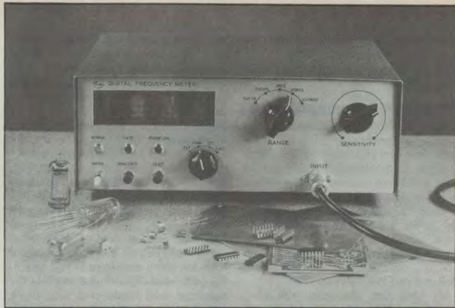
Our first digital frequency counter project, which appeared in the issues for February-June 1970. It used gas discharge tubes for readout, with a mixture of RTL, DTL and ECL ICs.

Actually, it wasn't too difficult in the early days, because fault symptoms in the limited range of valve projects could usually be recognised without having to search back through circuits and articles. But, as the range and complexity of projects increased, especially in the