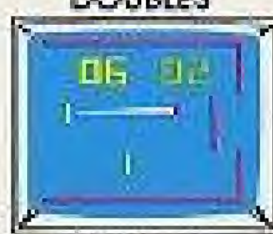
HOCKEY PACTICE DOUBLE