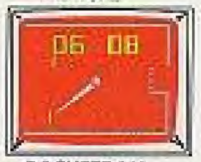
BASKETBALL PRACTICE DOUBLES