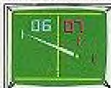
TENNIS CUTTHROAT 1 vs. 2