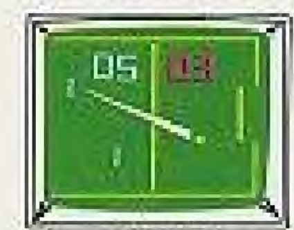
TENNIS PRACTICE DOUBLES