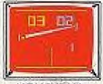
VOLLEYBALL CUTTHROAT 1 vs. 2