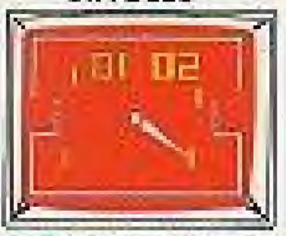
BASKETBALL DOUBLES 2 vs. 2

Shipping Carton: 4 boxes to carton Carton Size: 17 x 151/2 x 24% Weight: 30 lb. Cubic Feet: 3.8