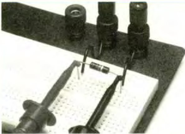
To begin your study of Ohm's Law you'll need to measure the voltage across a resistor. Using a high impedance digital meter will prevent you from loading down the circuit.

IT IS DIFFICULT, IF NOT IMPOSSIBLE, TO THINK ABOUT electrical resistance without also thinking about some form of mathematical representation. A digital readout, a moving needle, or even a color-coded resistor, it all comes down to numbers. That was not always the case.