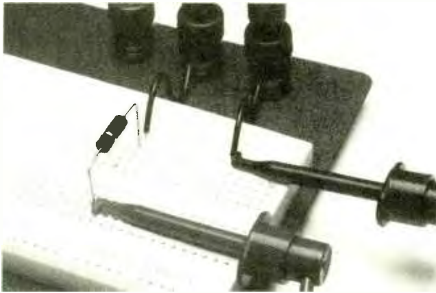
Measuring current requires that you open the circuit and place the meter into it as a part of the circuit.