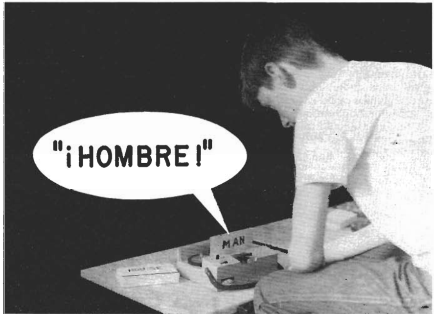
Languages are easier when correct pronunciation is heard while reading English word.

Place a card in the head area, and put the machine in the record mode. Slide the card toward the capstan and capstan idler until the card is caught in the pinch between the two. They will pull the card past the heads and eject it at the other side. While the card is