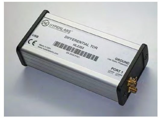
Fig. 6: HL2202 high-speed signal path analyser, which costs US$ 7495

----Vishal Gupta, senior application consultant (RF/MW, Surveillance), Keysight Technologies