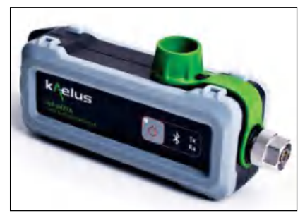
Fig. 5: iVA-0627A cable and antenna analyser from Kaelus

A new power measurement device launched recently serves the purpose of monitoring the components in analogue or digital LMR systems functioning between 144MHz and 960MHz.