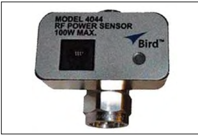
Fig. 3: Model 4044 power sensor can be used in conjunction with 3141 Channel Power Monitor to measure the output power of either analogue- or digitally-modulated radios at power levels up to 100W