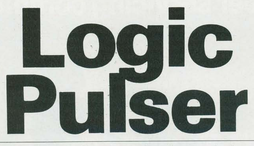
A simple, inexpensive companion for your logic probe