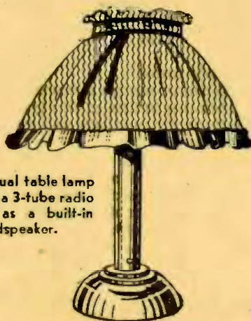
This unusual table lamp conceals a 3-tube radio as well as a built-in loudspeaker.

There's another reason why the table model is winning popularity on this side of the Atlantic. Try asking half a dozen friends to see a television program on a console model with a 48-square-inch image. You'll not find it too easy to seat