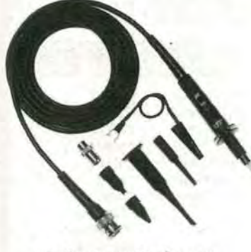
Ask about quantity discounts

Model Shown: 510-SW-1 100 MHZ, Switchable X1-X10.......$36