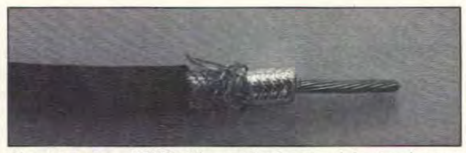
Photo B. A piece of 9096 with an end stripped and the tinned copper braid pulled back to reveal the aluminum-mylar film shield. You would not normally do this to install connectors. That #9 stranded center conductor is a healthy bunch of copper.