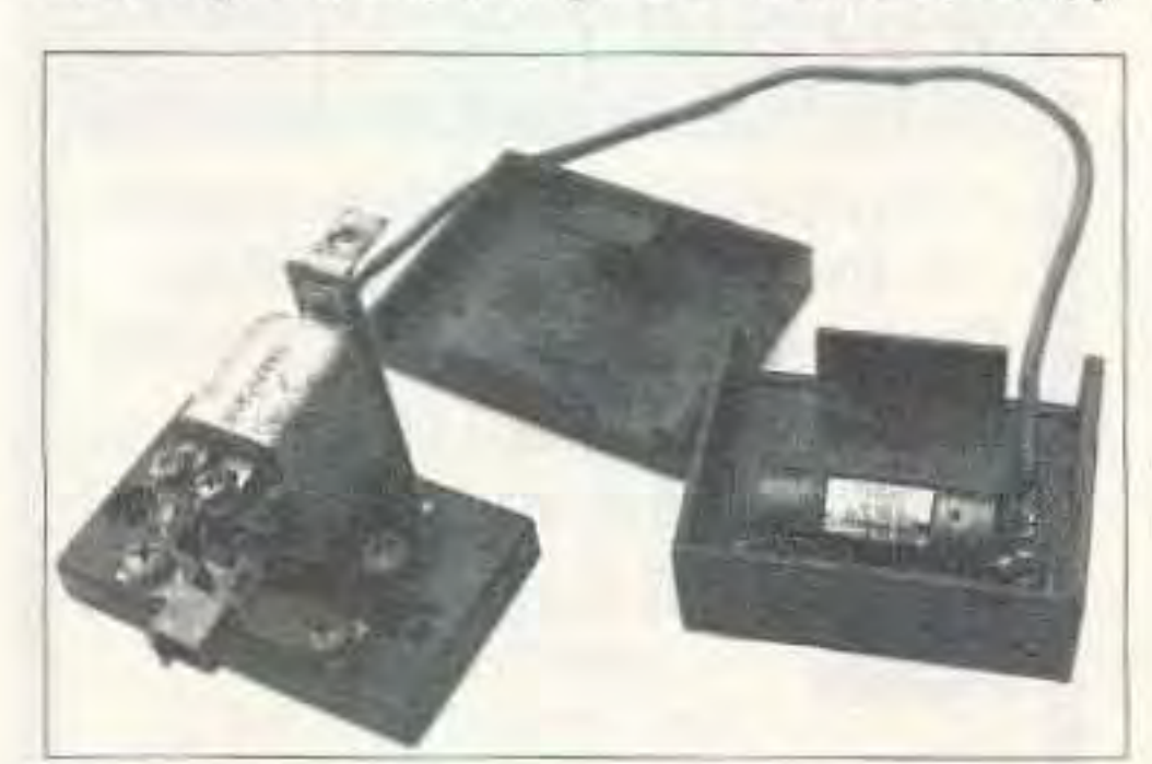
Photo A. Typical control relay and fuse block suitable for use with 100-watt mobile radios.

Because of my forgetful nature, I like it when everything turns off when I remove the ignition key. Achieving total key shutoff can be complicated since most manufacturers recommend connecting the radio's power cable directly