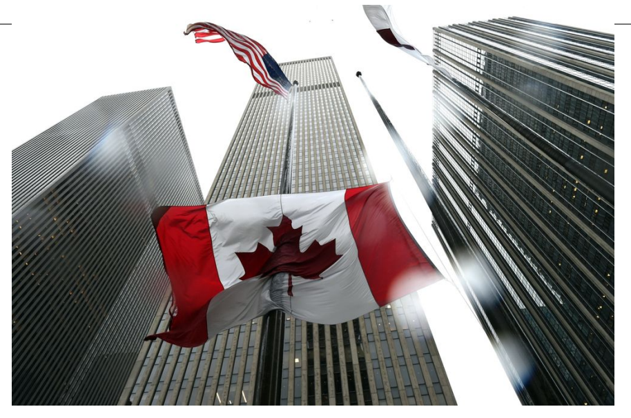
Canada's middle class is on the rise.

By <u>Justin Fox</u> August 29, 2019, 5:30 AM PDT