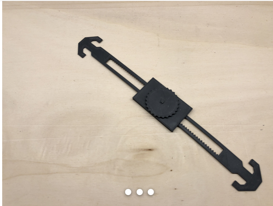
Adjustable Ear Guards