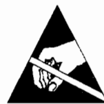
Figure 1. ESD susceptibility symbol.

The ESD susceptibility symbol (see Figure 1) consists of a triangle, a reaching hand, and a slash through the reaching hand. The triangle means "caution," and the slash through the reaching hand