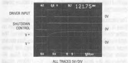
Figure 2. Transceiver Turn-On Via Logic Input

Figures 2 through 4 demonstrate the automatic SHUTDOWN control's response to logic and RS232 signals, as well as zero data flow. The minimum pulse width is 50\mu s and the drop out time is set to 50ms. The power supply outputs — the lower two traces in Figures 2 and 3 — become active in less than 200\mu s . When active, the circuit consumes 16mA of quiescent current. In SHUTDOWN state, the Q-current drops to 50\mu A .