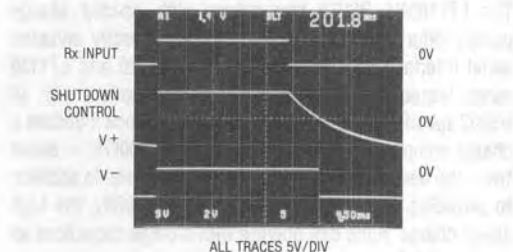
Figure 3. Transceiver Turn-On Via Receiver Input