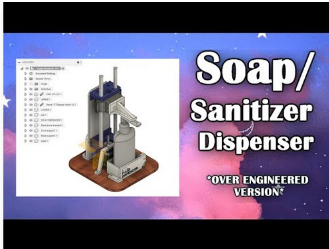
Automatic Soap/Sanitizer Dispenser