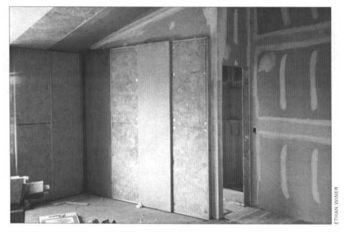
FIG. 3: The bass traps are built using wooden frames and plywood panels, sealed with caulk to make them airtight. The gap below each frame allows room for the carpet, which is not yet installed.

The plan drawing views are what you'd see looking down into each box, so they don't show the end caps which seal and complete the boxes. However, the accompanying photos show how the finished traps should look. Note that the length of the end caps in the parts list is slightly overstated, and the true length depends on the actual thickness of the various boards. The correct length is two feet minus twice the thickness of each 1x3 or 1x4 or 2x2, and I recommend that you follow the old carpenter's adage: "Measure twice, cut once."