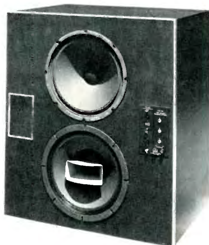
Fig. 3—The UREI Model 813 Time-Align™ Monitor for use in studio control rooms. The 604-8G high and low frequency drivers are locked together and are, therefore, Time-Aligned™ by a passive time delay plus crossover network.

(15in.) woofer in this system also receives its signal via a time delay/crossover network. Besides offering the 813 Time-Align™ Monitor as a complete system, UREI also supplies Time-Align™ crossover networks for the Altec 604-8G and the older 604-E.