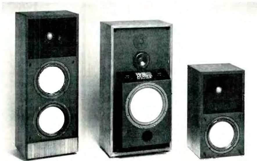
Fig. 1—Time-Align™ loudspeakers by Sonic Energy Systems. Left to right: the Model TA-10F floor standing system with passive radiator, the Model TA-12 three-way floor system, and the Model TA-10 two-way bookshelf speaker system. All drivers in these systems are physically offset from each other in the front to back plane.

recording. A good splice is virtually undetectable because the amplitude and time characteristics of the program at the point of the splice are very carefully matched. The same thing can also be said of the Time-Align™ technique as applied to loudspeaker design. Both the amplitude and time characteristics vs. frequency are carefully adjusted, with particular attention paid to splicing the time characteristics of any two adjoining frequency ranges. Thus, as the acoustic output of the driver covering the lower frequency portion of a given range of frequencies is reduced in amplitude by its network, the acoustical position of driver covering the next higher range of frequencies including the parameters of the network feeding it are adjusted to provide a virtually undetectable splice in