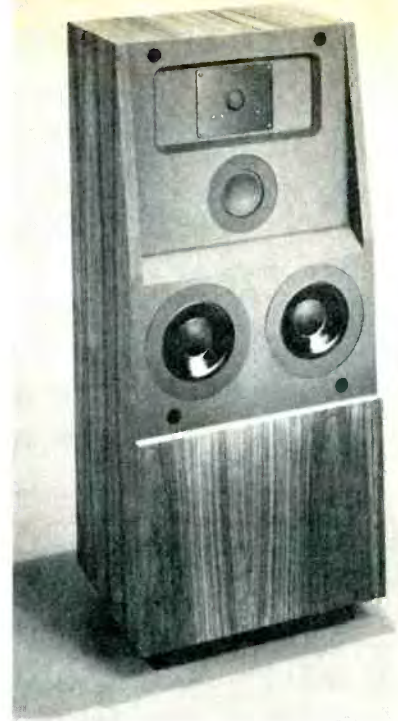
Fig. 2—The Sonex Model Two Loudspeaker System. This system uses two small bass drivers with a passive radiator in the rear for fast response. The physical offset between the bass and midrange drivers is less than between the drivers in Fig. 1.

Since there are both physical and electrical methods available which can be used to properly adjust the acoustical position vs. frequency and therefore the Time-Alignment™ of acoustical output of a multi-way loudspeaker system, it is worthwhile to look at some different loudspeaker systems which are Time-Aligned™. Figure 1 is a photograph of three Time-Align™ loudspeakers, manufactured by Sonic Energy Systems. The smallest, the TA-10, on the right, is a Bookshelf system employing a 25 cm (10 in.) woofer and a 3.8 cm (1.5 in.) tweeter. The physical offset between the woofer and tweeter in this system is less than that of the woofer and the midrange of the TA-12, shown as the