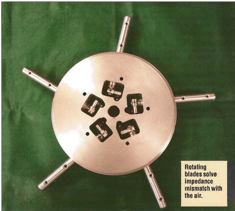
Rotating blades solve impedance mismatch with the air.

woofer. Four years in development, the rotary woofer solves the impedance mismatch with the air by rotating a set of blades. Sound represents very small changes in air pressure. As the blades rotate at a constant speed, the pitch follows the signal from the audio amplifier, changing the pressure of the air just as a cone loudspeaker does. The blades have no pitch when there is no audio signal. The rotation of the blades grabs the air far more effectively than a cone and enables high sound levels with a far better conversion of energy. At extremely low frequencies, the rotary woofer has acoustic output equivalent to many cone woofers combined.