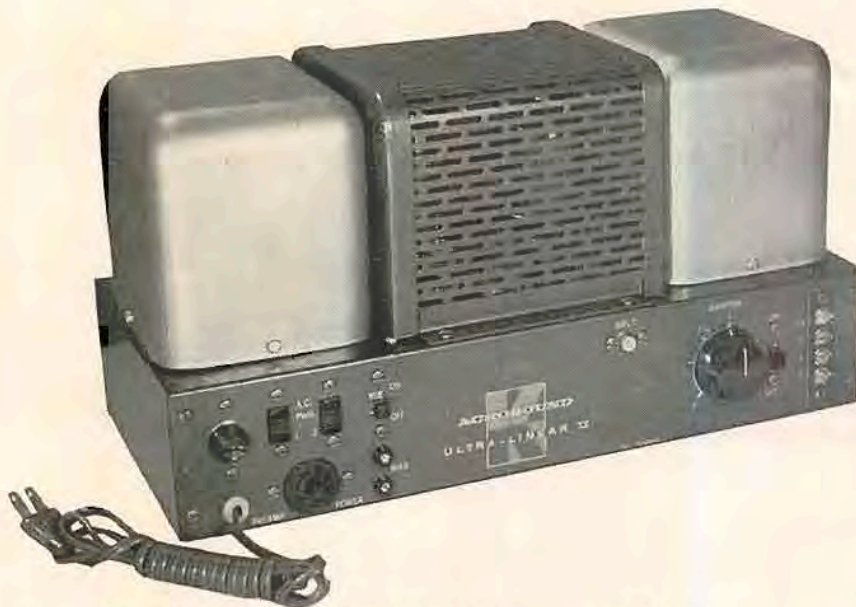
The Acrosound Ultra-Linear II amplifier discussed in this article.

terms of the applied voltages E_a and E_b . We may then solve these for the current in the feedback circuit, i_f , and the load current, i_2 .