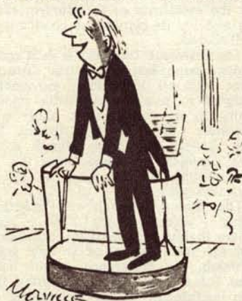
And now we would like to play a little number that has been climbing up the charts for the last 200 years. ("TV Times").

Whereas old-fashioned pickups used to peak at about 3 to 4KHz, modern cartridges tend to peak at about double this frequency, or beyond. If the peak is a prominent one and the loud-